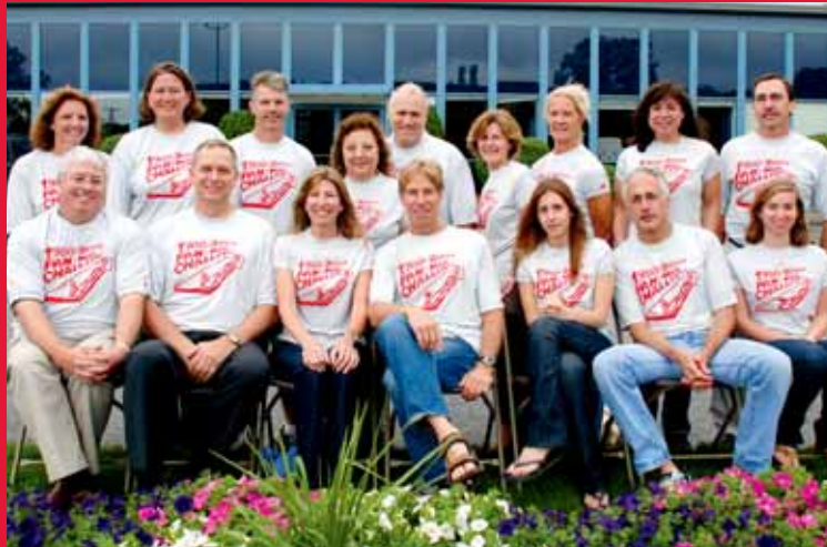
The PMC Staff.