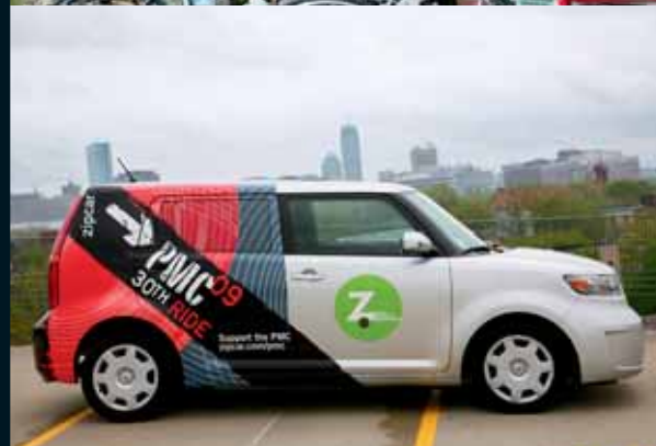
Top More than 20 Zipcar employees joined the Zipcar PMC team in 2009.