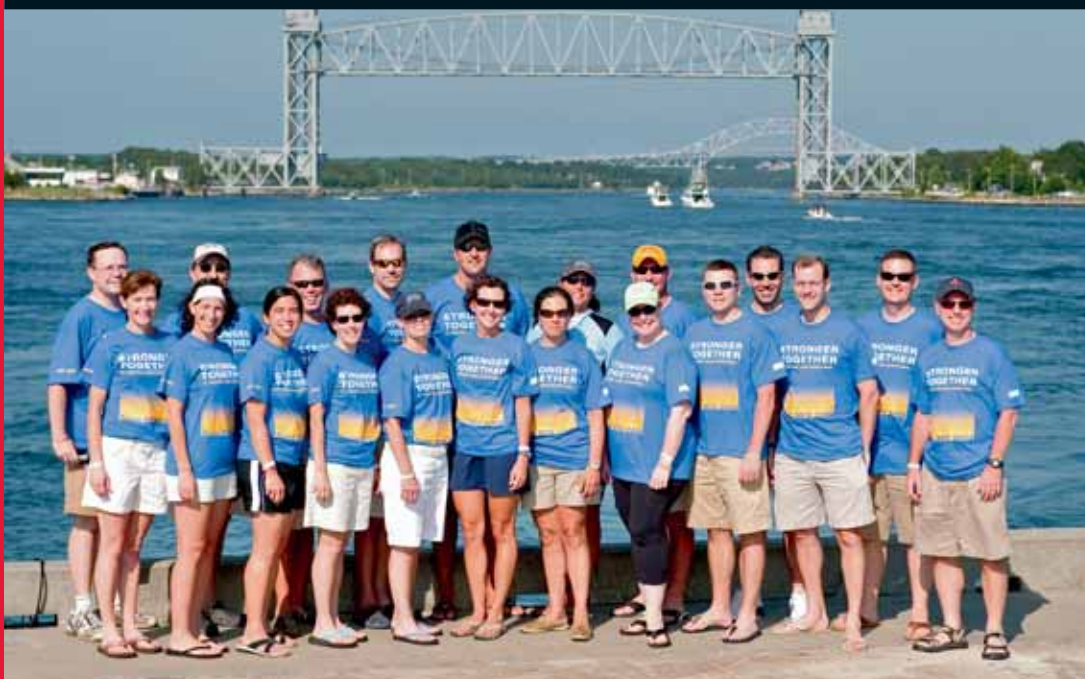
Left Team MFS.