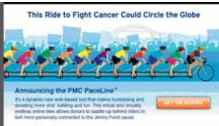
Right The PMC PacerLine home page.