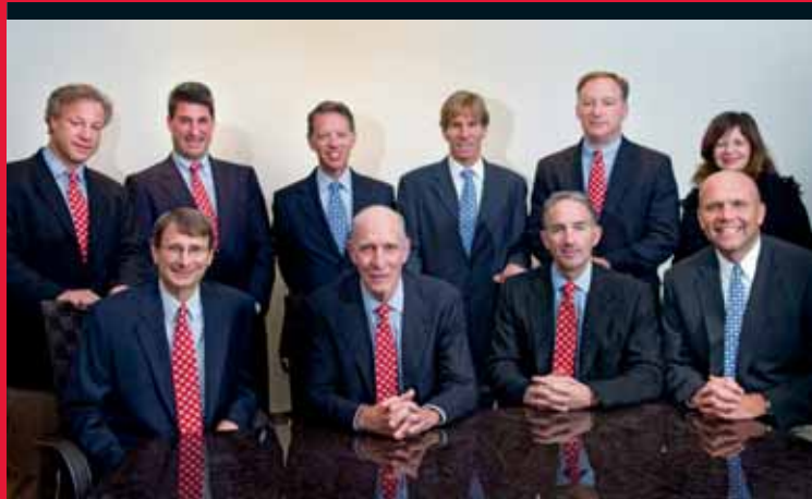
The PMC Board.